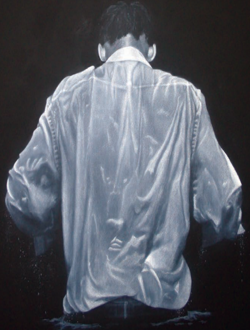
Portrait: Angelique Van Antwerpen VCE STUDENT White Pencil Illustrated On Blackboard